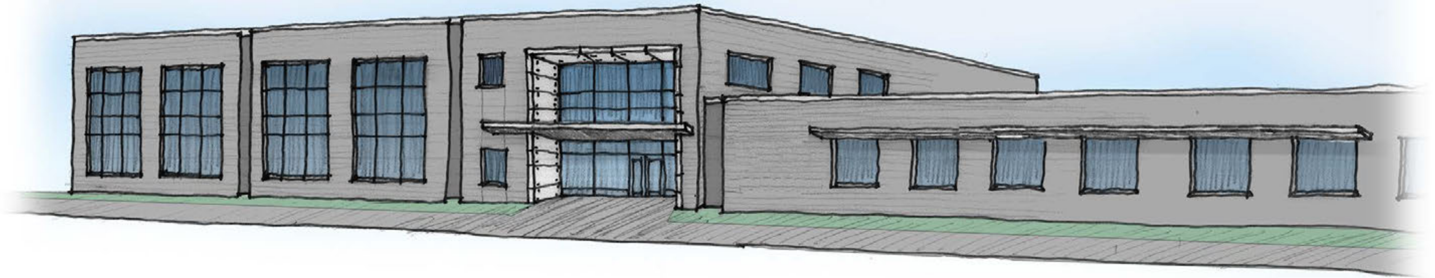
VIEW AT PROPOSED MAIN ENTRY